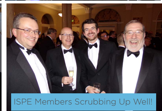
ISPE Members Scrubbing Up Well!

These awards are a chance for the ISPE UK Affiliate to thank and recognise individuals, companies and organisations, nominated by the regional committees, for their support of the ISPE as a whole, and in particular in the UK.