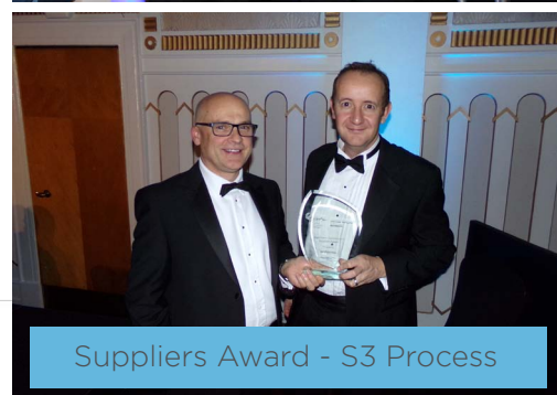
Suppliers Award - S3 Process